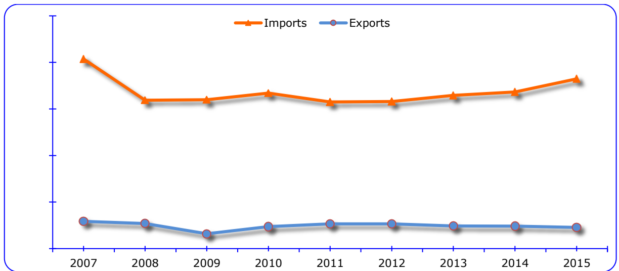
Figure 5: Trade Balance, in Physical Terms, 2007-2015 (thousand units)