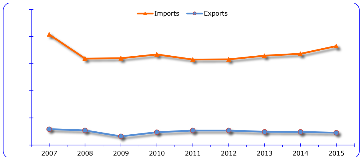
Figure 6: Trade Balance, in Value Terms, 2007-2015 (million EUR), in import/export prices