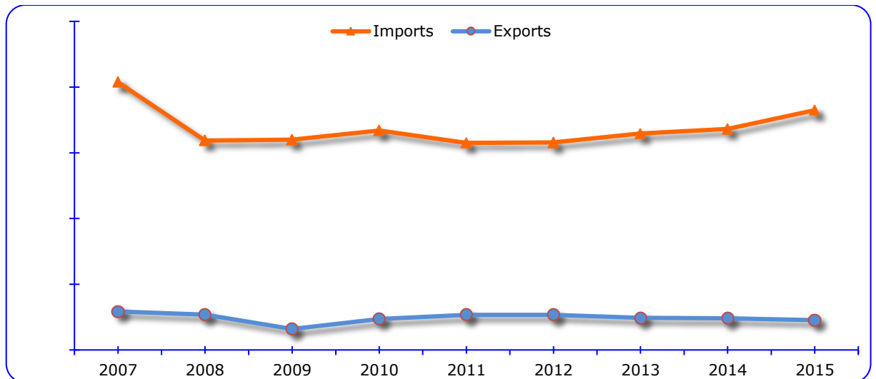
Figure 6: Trade Balance, in Value Terms, 2007-2015 (million EUR), in import/export prices