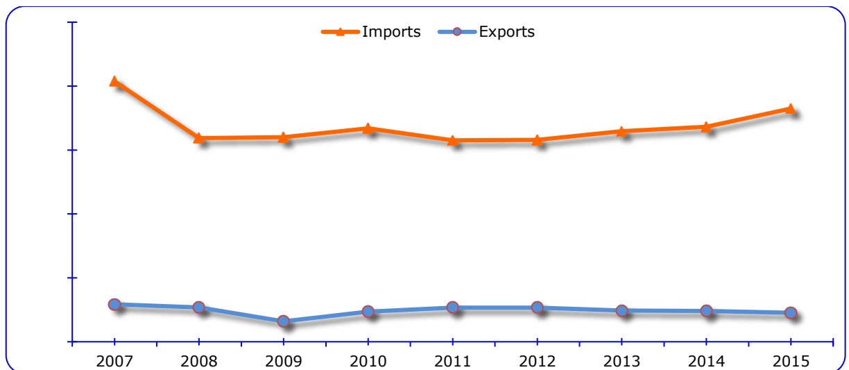
Figure 6: Trade Balance, in Value Terms, 2007-2015 (million EUR), in import/export prices