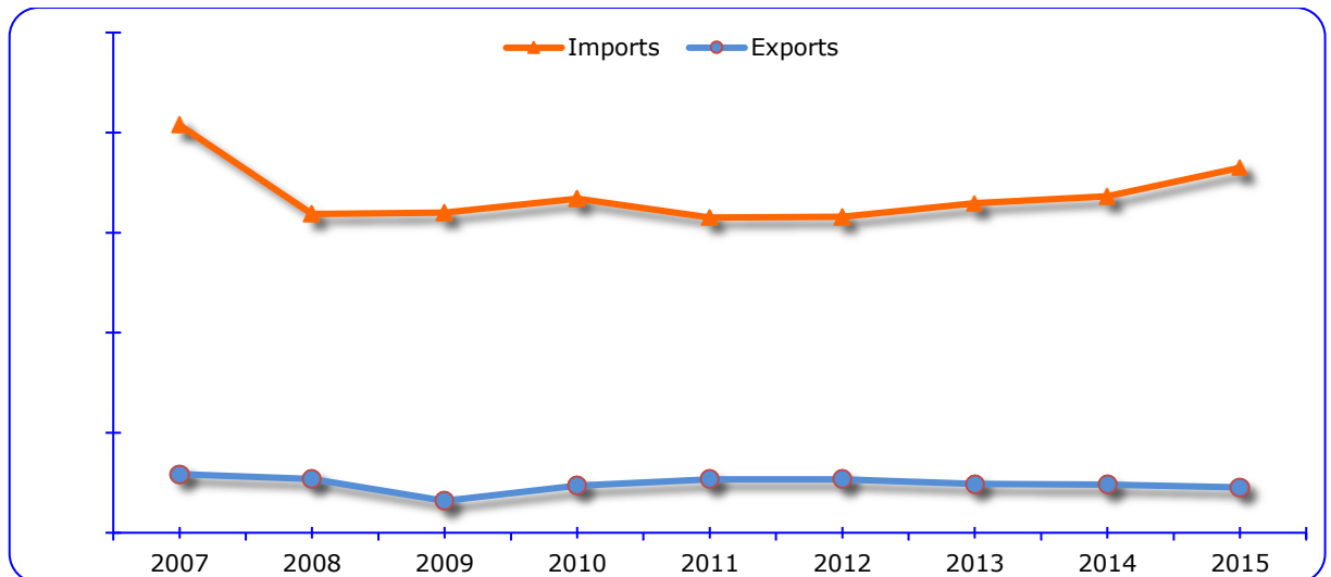
Figure 6: Trade Balance, in Value Terms, 2007-2015 (million EUR), in import/export prices