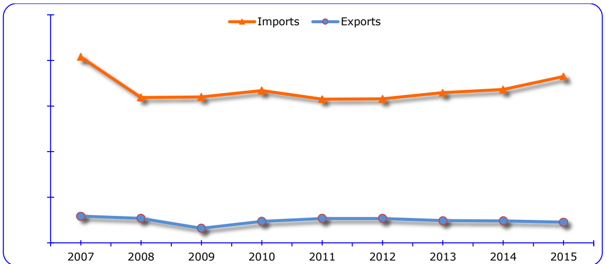
Figure 6: Trade Balance, in Value Terms, 2007-2015 (million EUR), in import/export prices